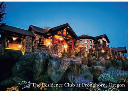
The Residence Club at Pronghorn, Oregon

Ready for success that opens doors? Talk to us. We'll hand you the key.