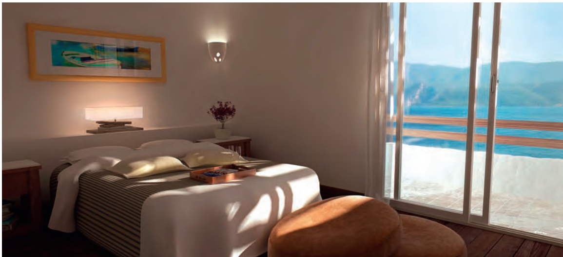
Halcyon Hills Luxury Resort & Spa on the Greek island of Samos, is a combination of ancient tradition and modern luxury. The resort employs a variety of eco-technology and includes different styles of property, all with sea views. The luxurious three-bedroom villas, pictured, will also have private pools.