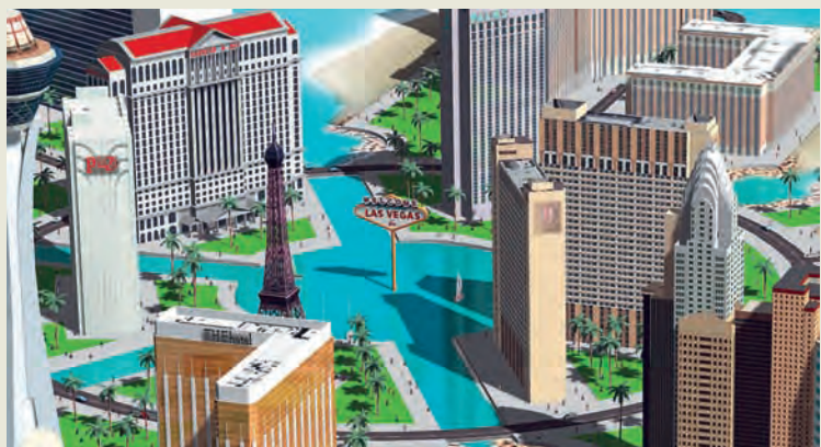
A Las Vegas-style international gaming resort will be at the heart of The International Riviera, which is based on 'year-round tourism and living'.