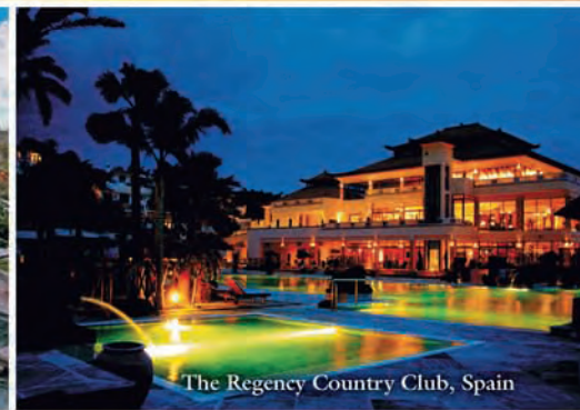
The Regency Country Club, Spain

To take a closer look at The Registry Collection experience, visit www.theregistrycollection.com