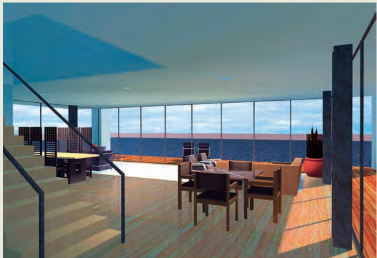
The luxury villas are designed to blend European elegance with the futuristic pioneering spirit of Dubai.