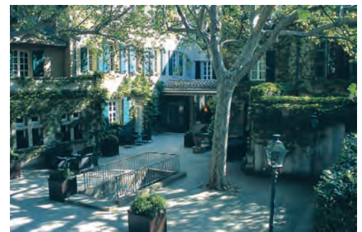
Pictured top: The Les Maisons de Baumanière boutique hotel and pool at the exclusive Avignon location. Above left: The hotel suite interiors have been styled by Genevieve Charial, who will be designing the fractional interiors in the same style. Above right: The property's private grounds are a peaceful haven.

Maisons de Baumanière – Gordes is the second development, nestling in the Luberon Valley and close to the ancient village of Gordes. Set in its own magnificent gardens, all properties will have stunning views over the valley.