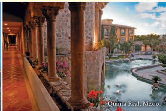
Quinta Real, Mexico